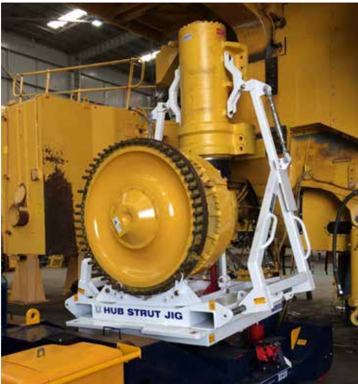
VWT XC20 with the Universal Hub and Strut Jig