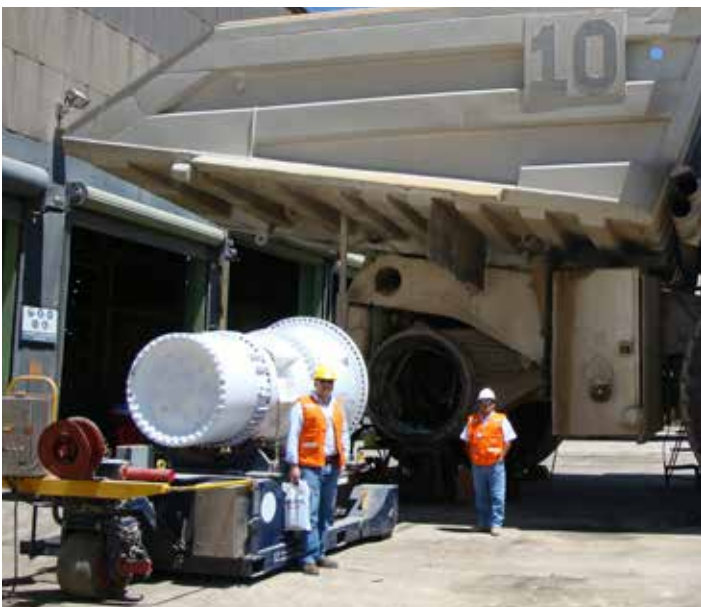
VWT XC20 with the Universal Large Wheel Motor Jig