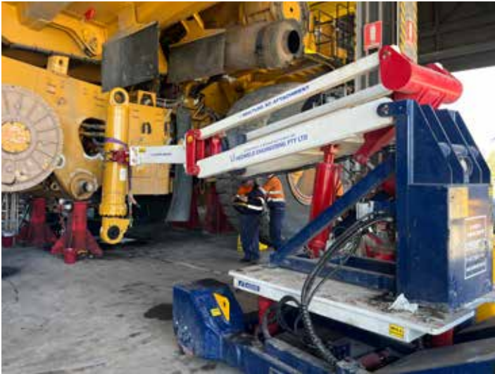
VWT XC25 with the Multijig XC and Cylinder Handler

When an OEM component is unique and cannot be handled by our universal jigs we have OEM specific jigs available eg. Komatsu Front Quarter Jig ( Part No. TL02038 ).