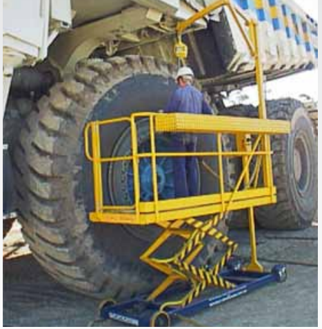
Trilift® Variable Height Work Platform in use