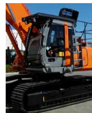
RotorStep L Ladder shown fitted to a Hitachi EX350 excavator