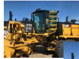
RotorStep M3 Ladder shown fitted to a Cat 18M3 Grader