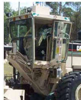
RotorStep G Ladder shown fitted to a Cat 16G Grader