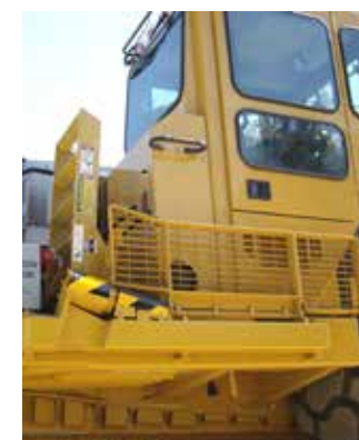
RotorStep S Ladder shown fitted to a Cat 657 scraper