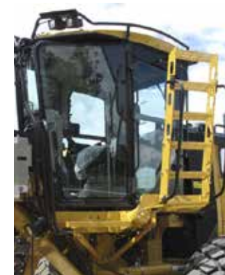
RotorStep GM Ladder shown fitted to a 16M Grader