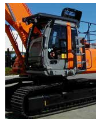
RotorStep L Ladder shown fitted to a Hitachi EX350 excavator