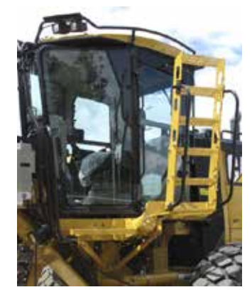
RotorStep GM Ladder shown fitted to a 16M Grader