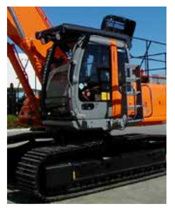
RotorStep L Ladder shown fitted to a Hitachi FX350 excavator