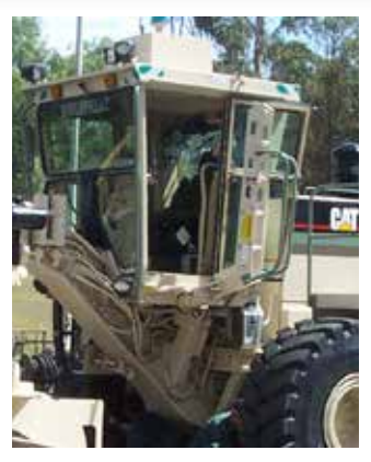
RotorStep G Ladder shown fitted to a Cat 16G Grader