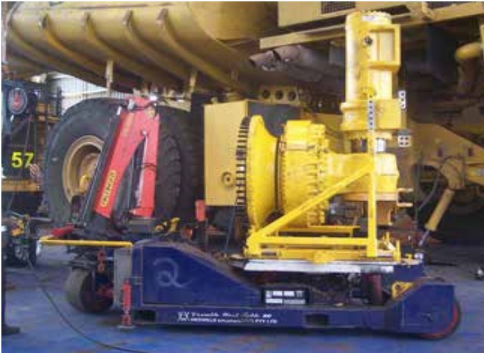
Trilift® Universal Hub & Strut Jig in use on VWT XC20

Visit www.hedweld.com.au and use the 'Search by OEM' tool to discover which innovative Hedweld products will improve the safety and efficiency of your fleet maintenance.