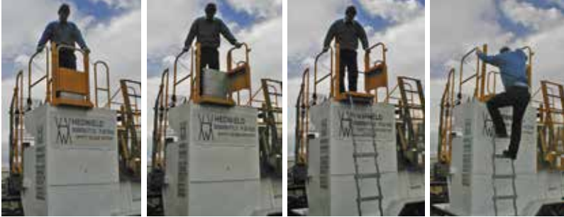
Step 1 Release lock by lifting the gate Step 2 Open gate Step 3 Push ladder out Step 4 Descend