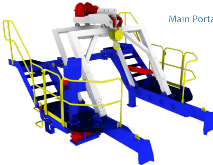
Main Portal Frame