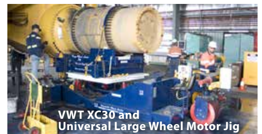
VWT XC30 and Universal Large Wheel Motor Jig