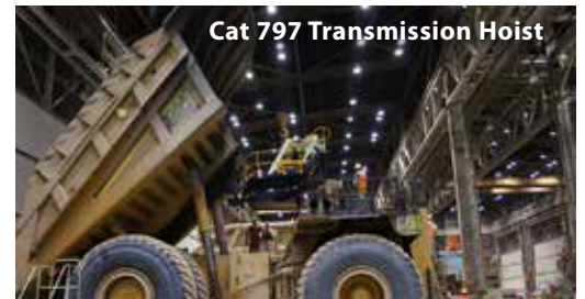
Cat 797 Transmission Hoist