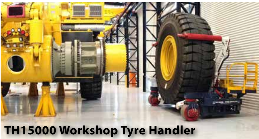
TH15000 Workshop Tyre Handler