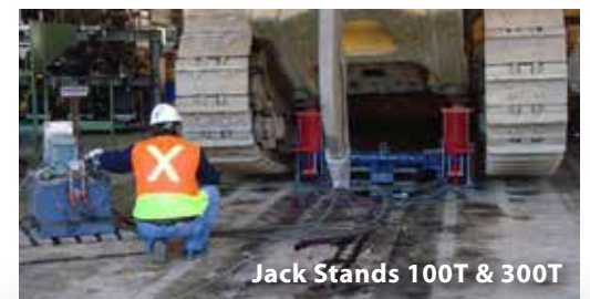
Jack Stands 100T & 300T