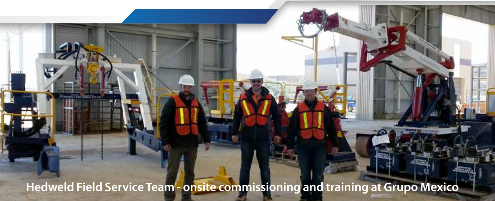
Hedweld Field Service Team - onsite commissioning and training at Grupo Mexico

Investing in this specialised tooling is great, but commissioning and training are as equally important to ensure that this tooling is utilised safely and to its full potential. Commissioning and training can be carried out by an authorised technician. Training consists of both classroom theory and workshop practical training and assessment. Certificates of Competency are provided to participants upon successful completion. Ask us for a quote.