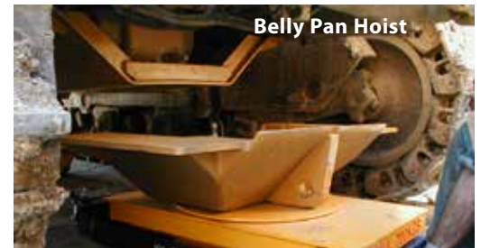
Belly Pan Hoist