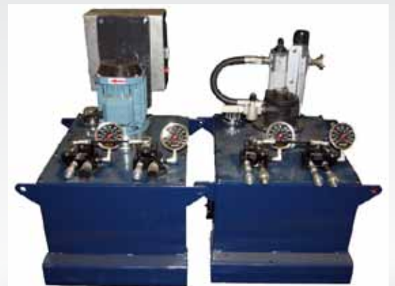
Electric Power Packs (Part No. CP03011) & Pneumatic Power Packs (Part No. CP03015)

Like the Jack Stands the Power Packs can be moved with a pallet jack, hydraulic lift or a powered transport trolley (Part No. TL13250) .