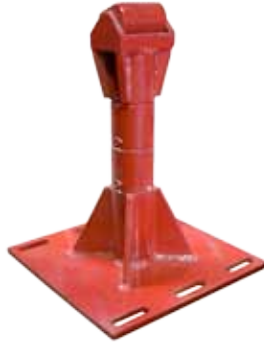
Adjustable Height Saddle Adaptor