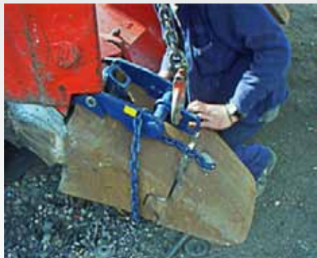
Chain N Lift fitted to a bucket tooth