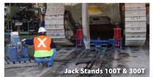
Jack Stands 100T & 300T