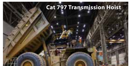
Cat 797 Transmission Hoist