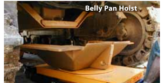
Belly Pan Hoist