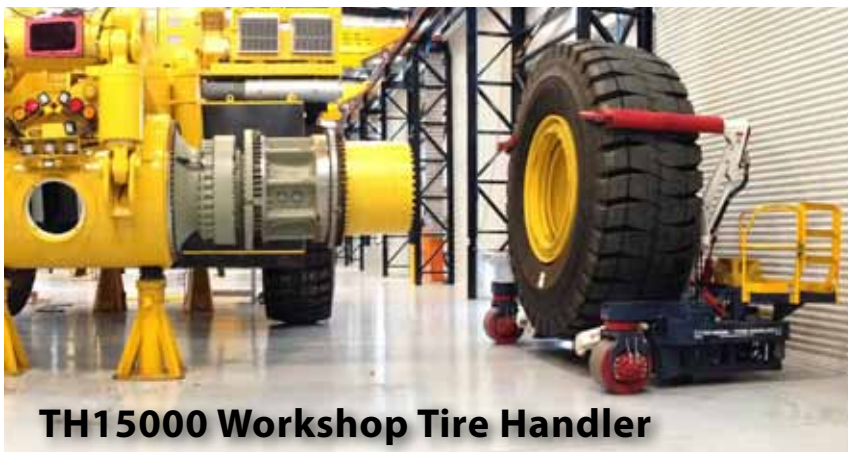
TH15000 Workshop Tire Handler