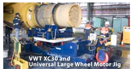
VWT XC30 and Universal Large Wheel Motor Jig